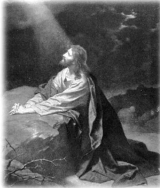
“Father, the hour is come; glorify thy Son, that the Son also may glorify thee...” John 17:1

The result of Jesus’ sacrifice will be “testified in due time,” when he will raise the dead and set up his righteous Kingdom among men, destroy all enemies (including death), and “when all things shall be subdued unto him, then shall the Son also himself be subject unto him that put all things under him, that God may be all in all.” (1 Corinthians 15:28) In Jesus’ own words, “And this is life eternal, that they might know thee the only true God, and Jesus Christ, whom thou hast sent. I have glorified thee on the earth: I have finished the work which thou gavest me to do.” John 17:3-4